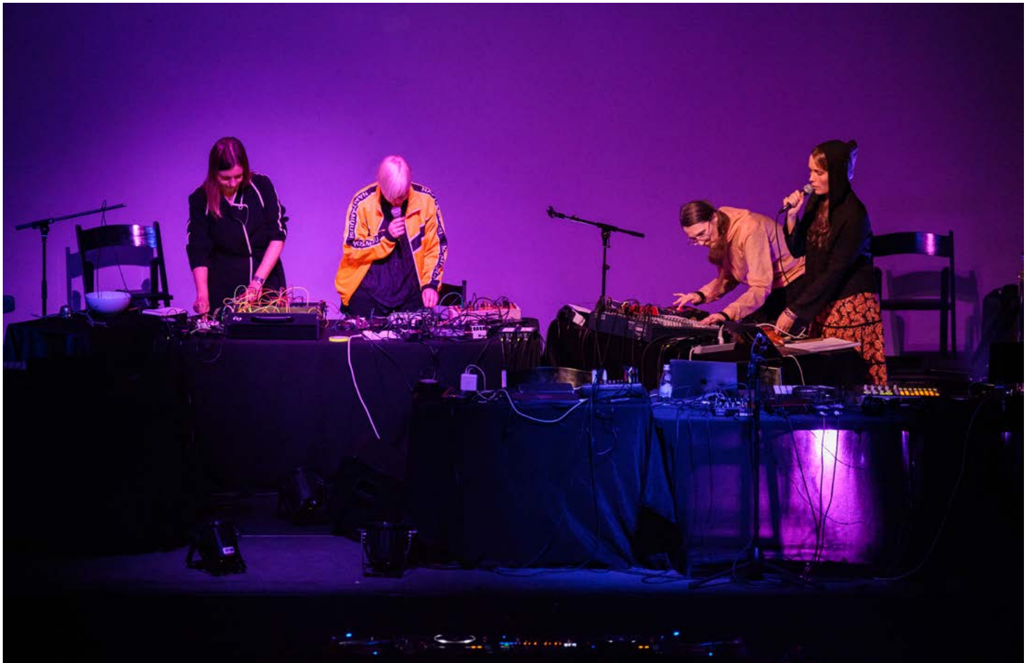
SONIC TONIC ASSEMBLY: Sonic Wilderness