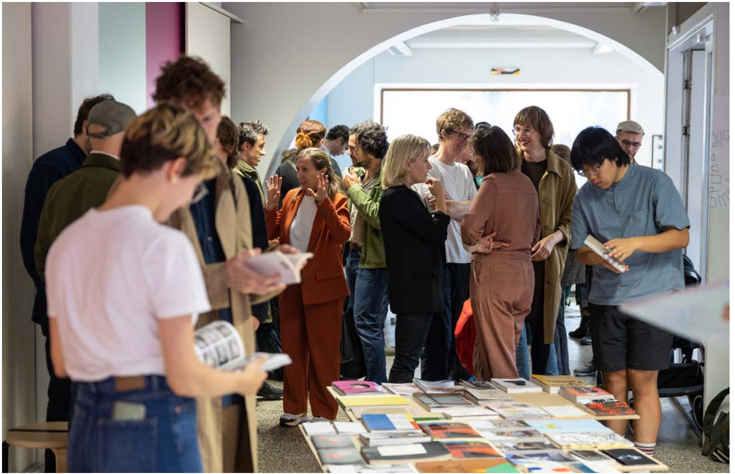
The Festival of Books and Voices