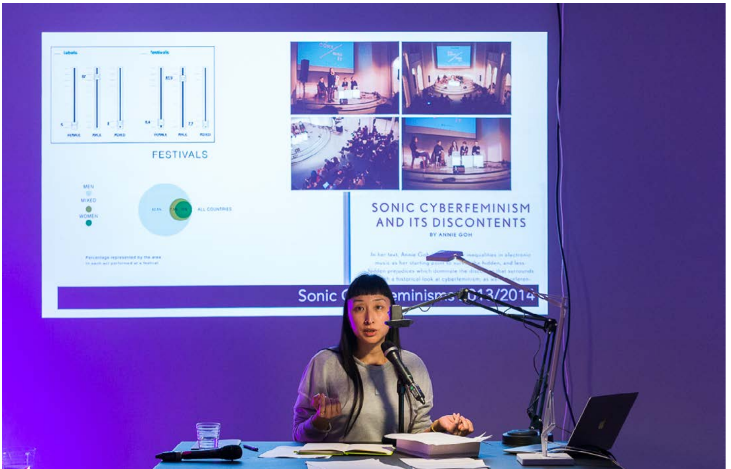
CyberFeminism Index x Sonic Cyberfeminism Book Launch and performance