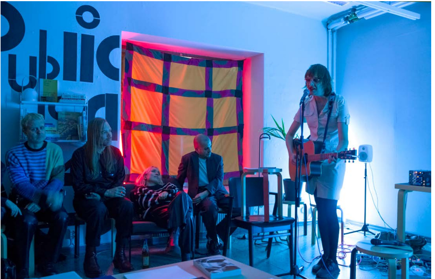
Closing event of the Festival of Books and Voices, photo by Myriam Gras