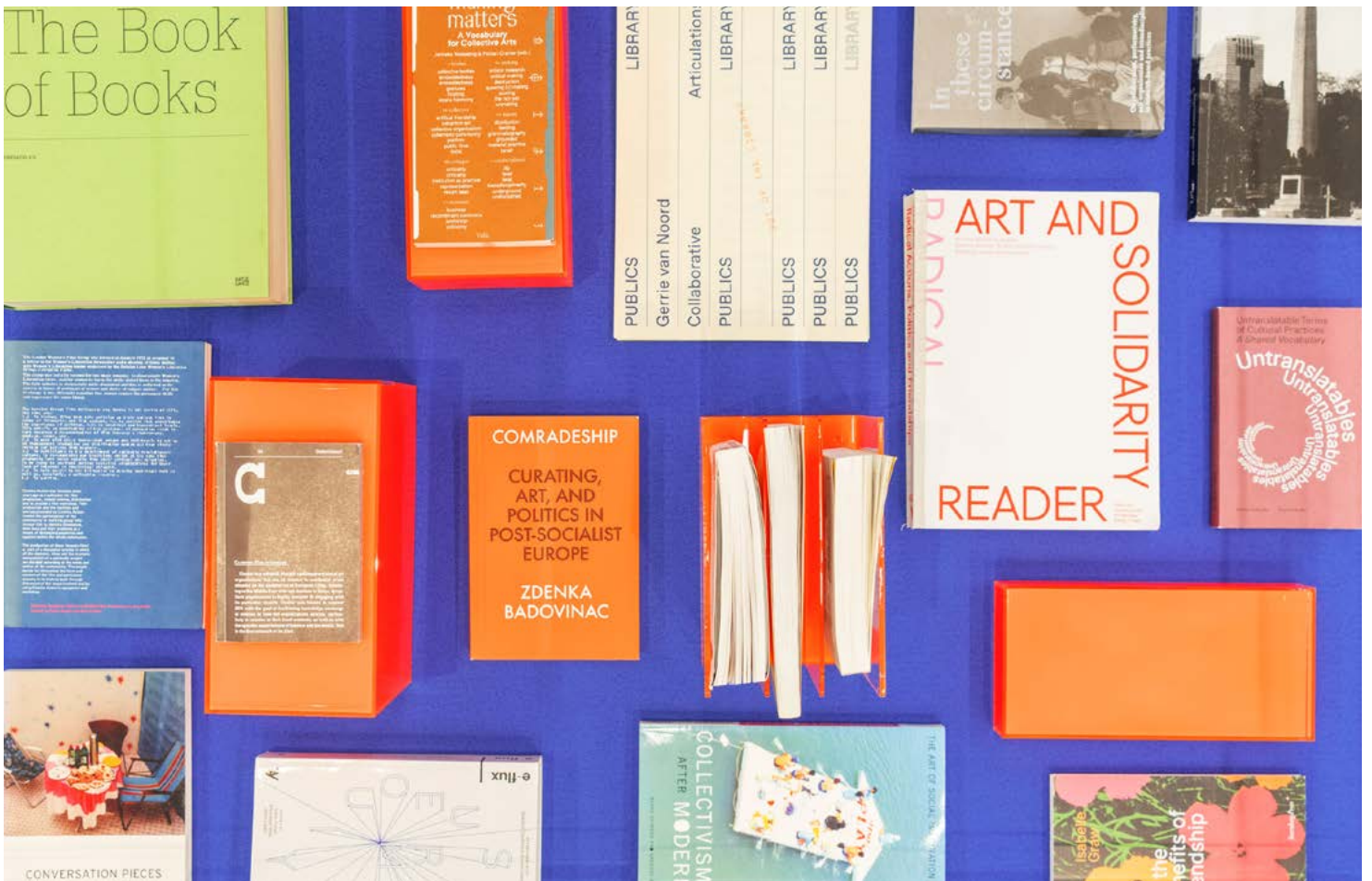
One Thousand Books Festival, Copenhagen, 2023