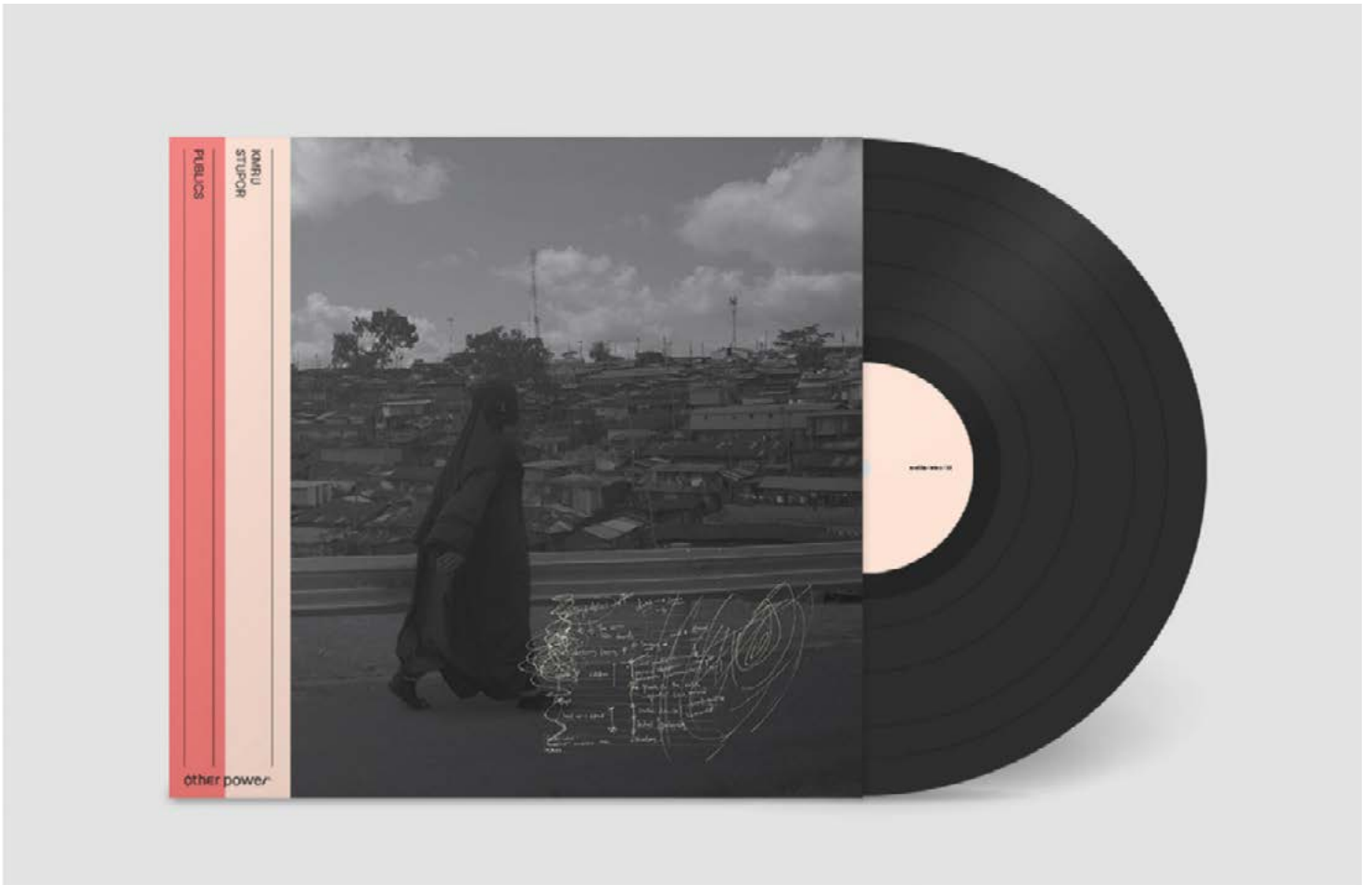
KMRU record release STUPOR with Other Power and Performa, 2023