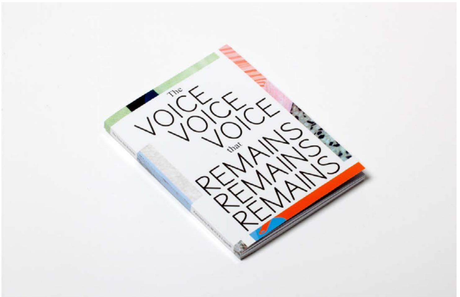
The Voice that Remains, published by Lugemik and PUBLICS, 2023