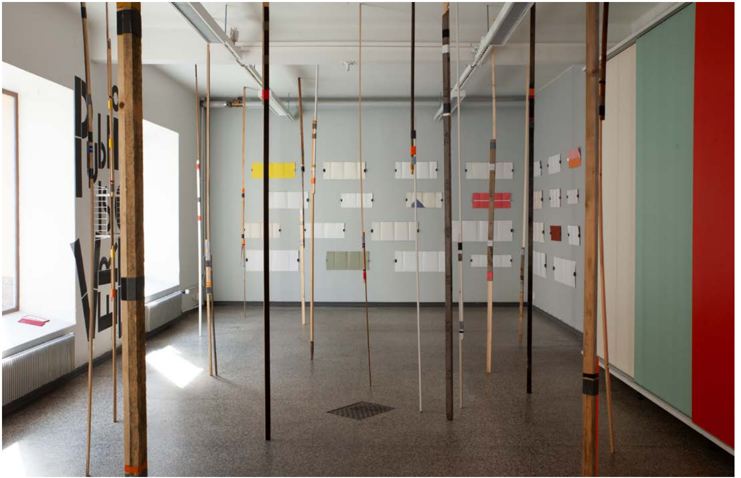
PUBLICS Coupling: Maarit Mustonen and Vlatka Horvat