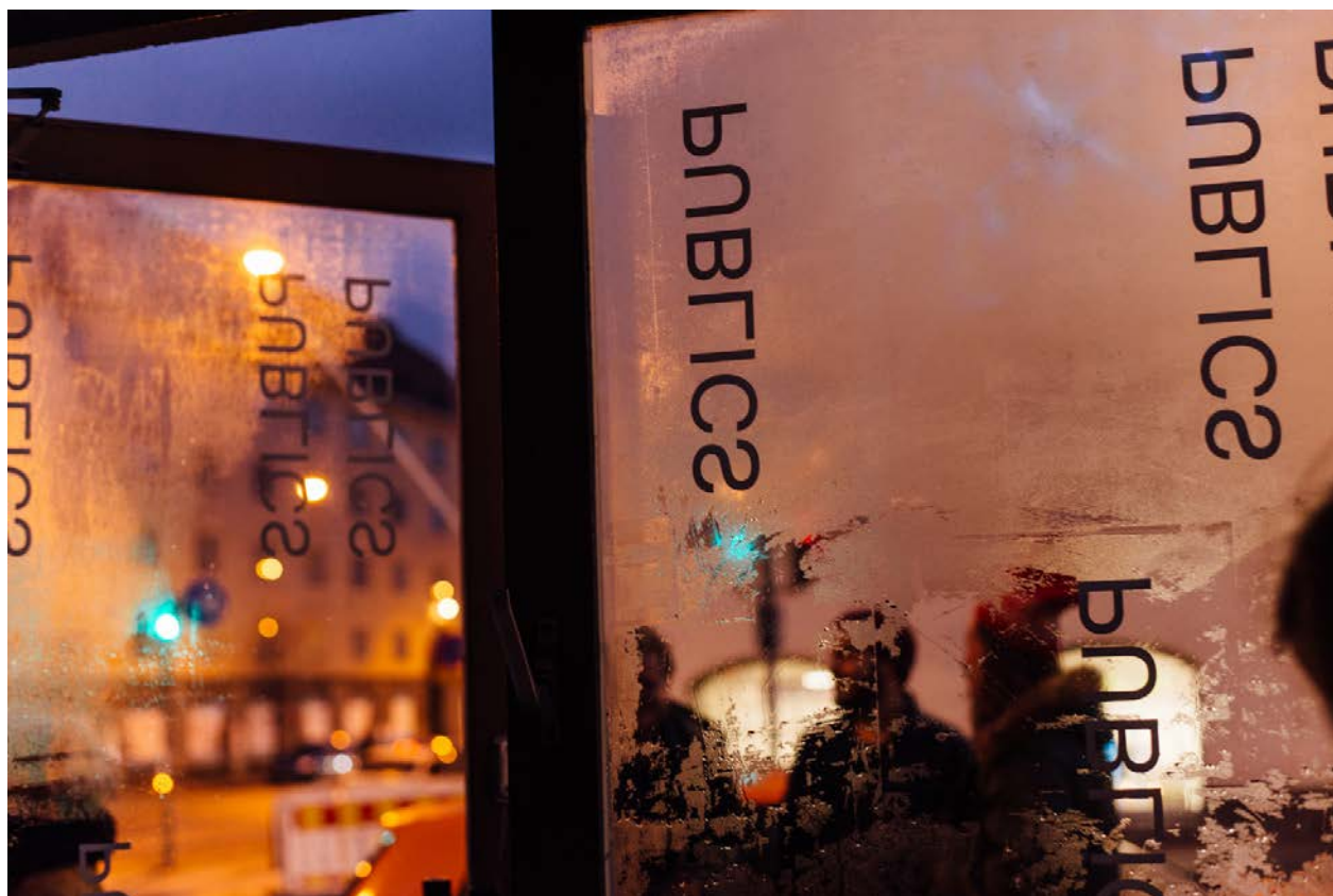
PUBLICS Launch 9/12/2017.

In 2017 PUBLICS was funded by the Kone Foundation, which is an independent and unaffiliated organization awarding grants to promote academic research, culture and art.