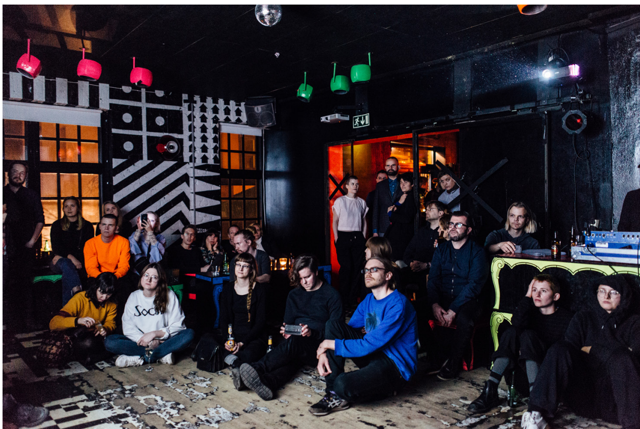
PUBLICS Launch in Kaiku.