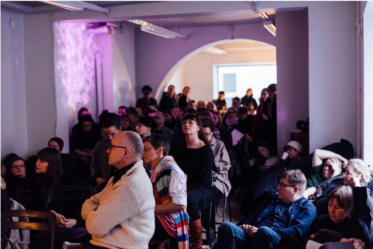
PUBLICS Launch 9/12/2017.