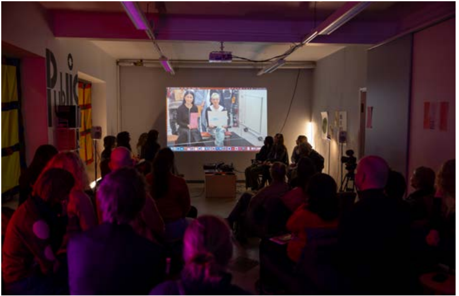
Book Launch of Reaching Out: A Book about Agency, Care, Identity and... at PUBLICS, February 23, 2026.