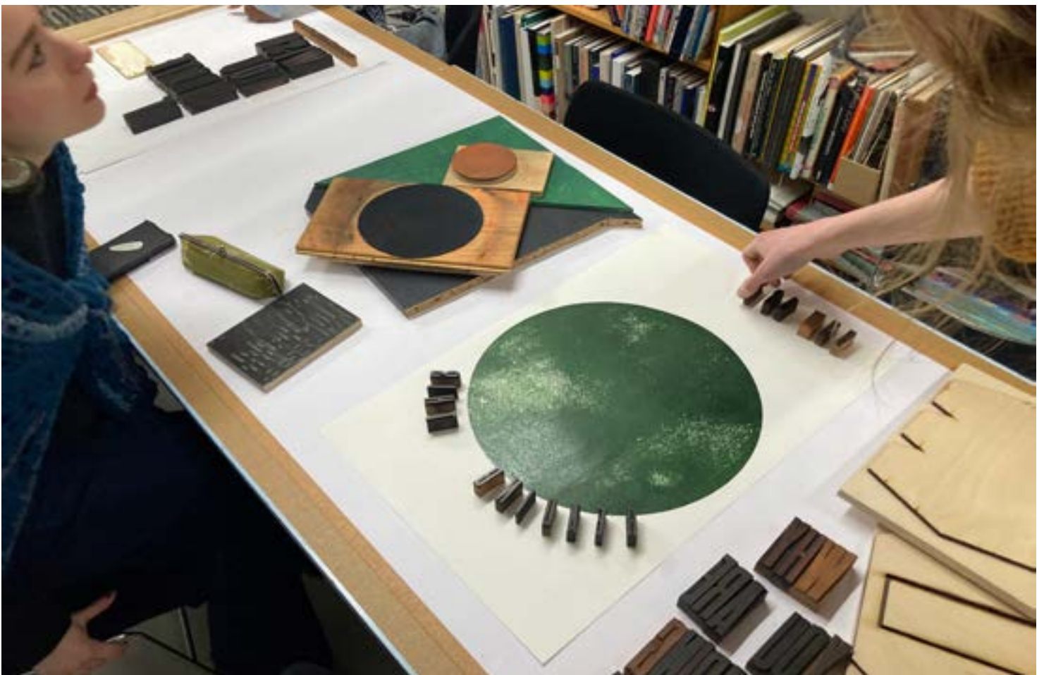
Printmaking workshop with Ilkka Kärkkäinen at SO-Helsinki, February 1, 2026.