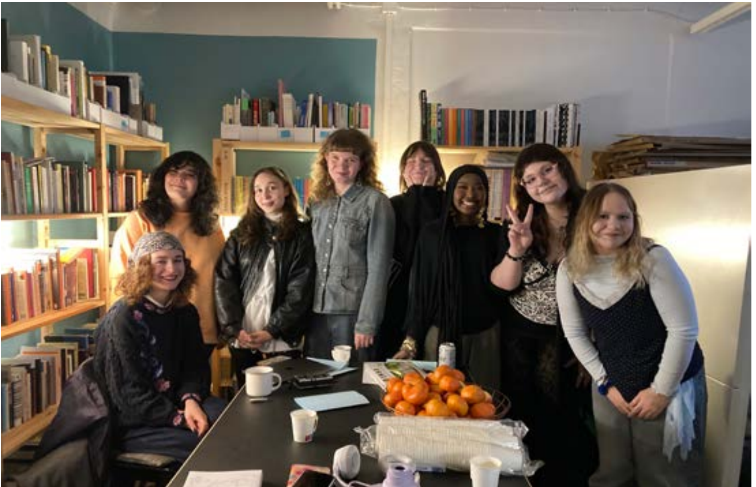
PUBLICS Youth Advisory Board 2025, PUBLICS.

The process was based on collective learning, shared responsibility, and ongoing exchange. A key part of working together was maintaining a space that feels comfortable, supportive, and open to all kinds of questions and reflections.