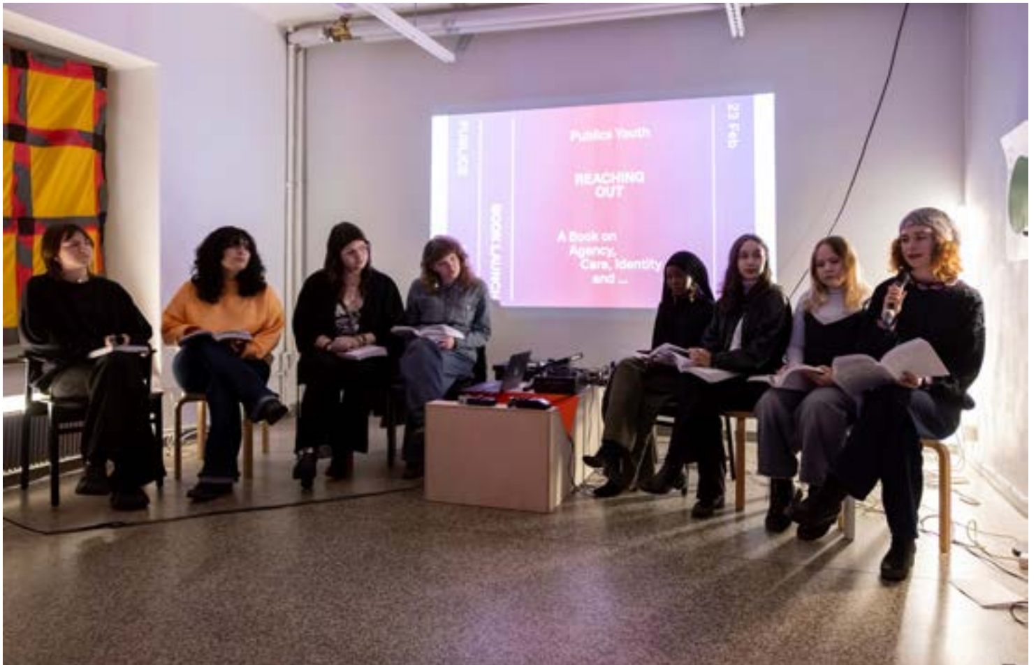
Book Launch of Reaching Out: A Book about Agency, Care, Identity and... at PUBLICS, February 23, 2026.