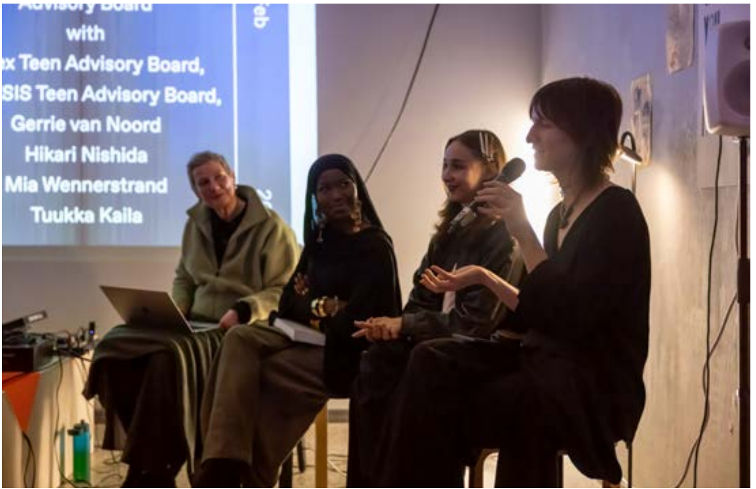
Book Launch of Reaching Out: A Book about Agency, Care, Identity and... at PUBLICS, February 23, 2026.