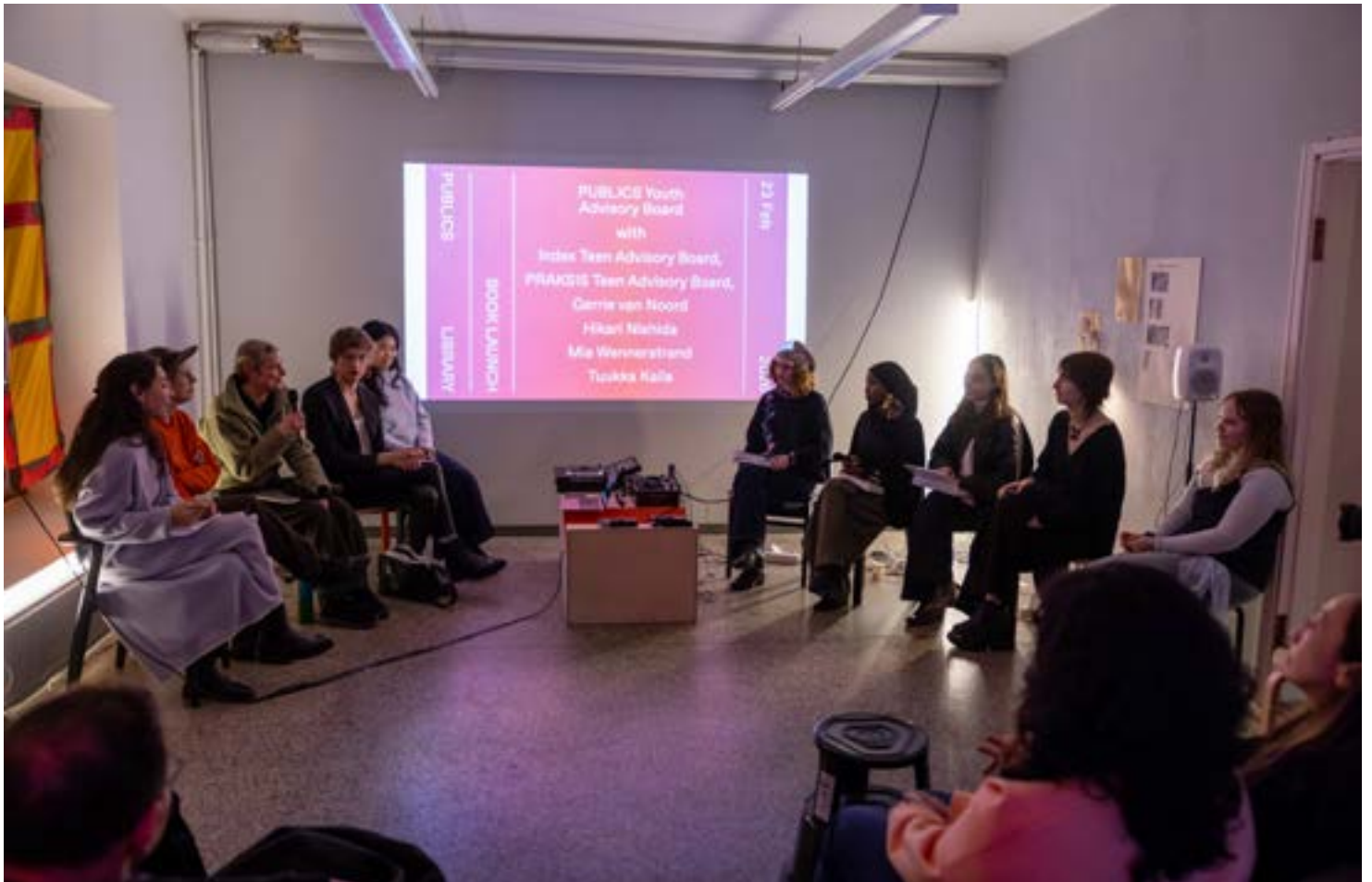
Book Launch of Reaching Out: A Book about Agency, Care, Identity and... at PUBLICS, February 23, 2026.