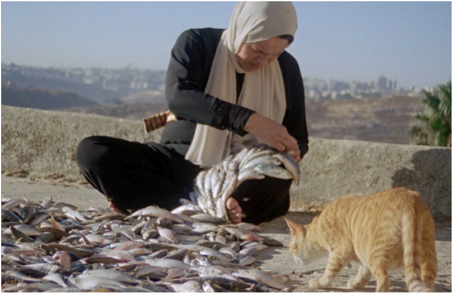
Noor Abed, PENELOPE, 16mm film still, 2014