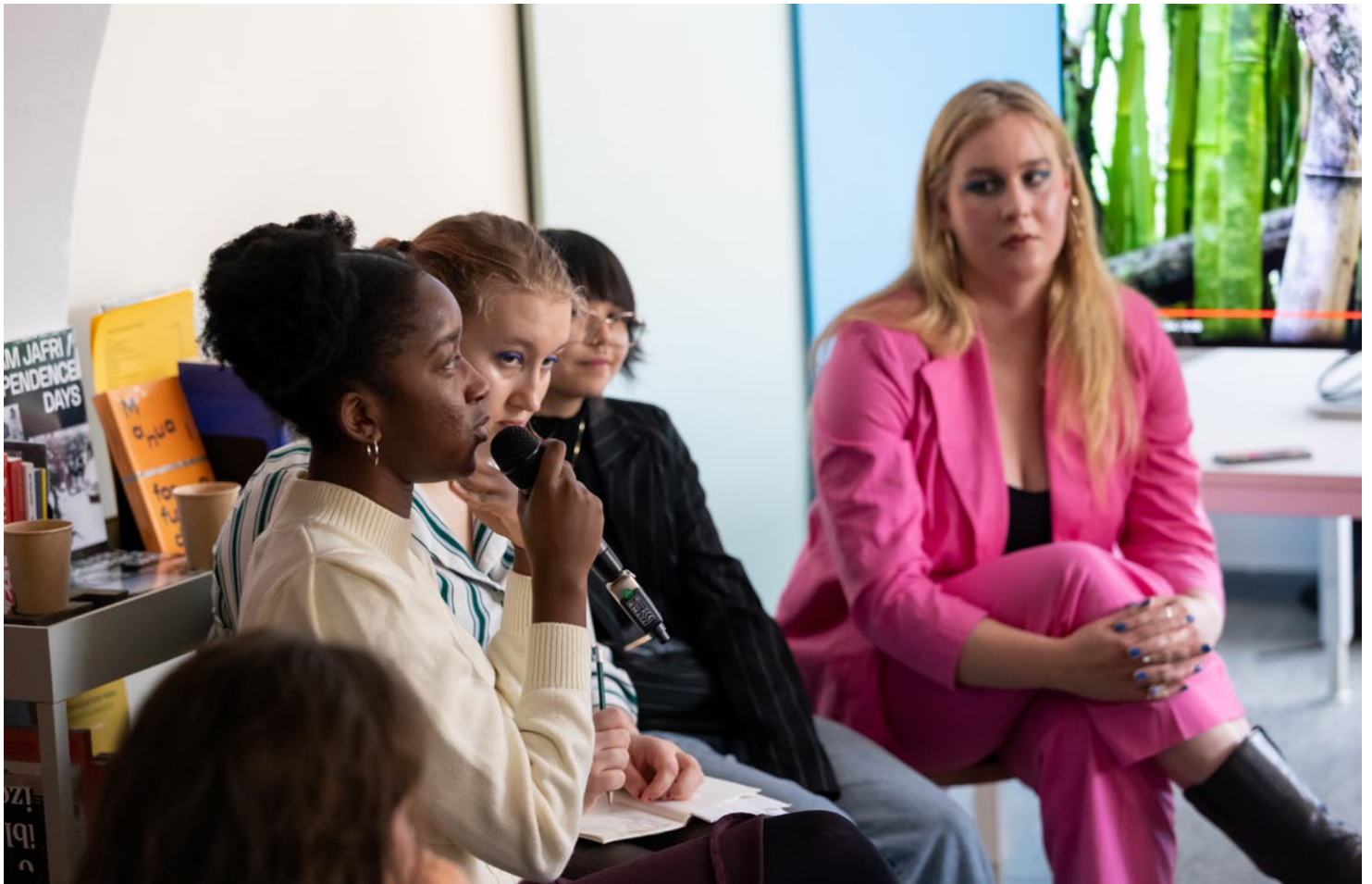
Today is our Tomorrow festival