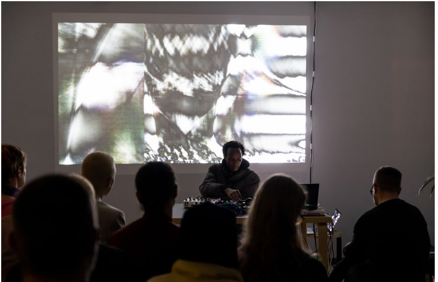
Today is our Tomorrow event, KMRU