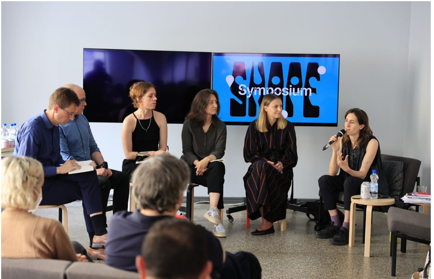
OPEN UP Shape Symposium panel discussion