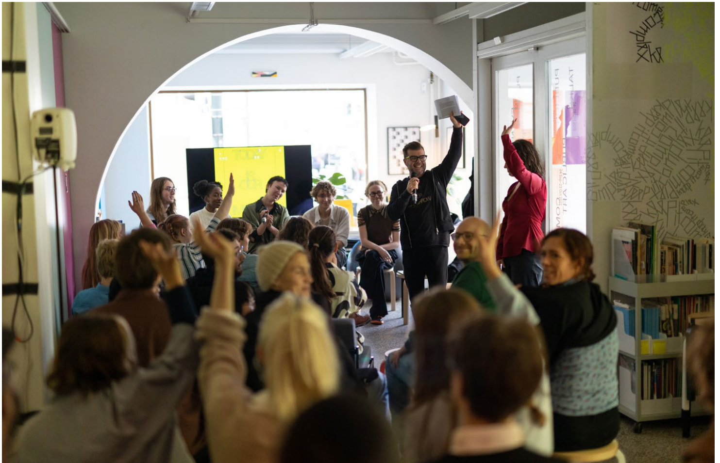
Today is our Tomorrow, photo by Aman Askarizad