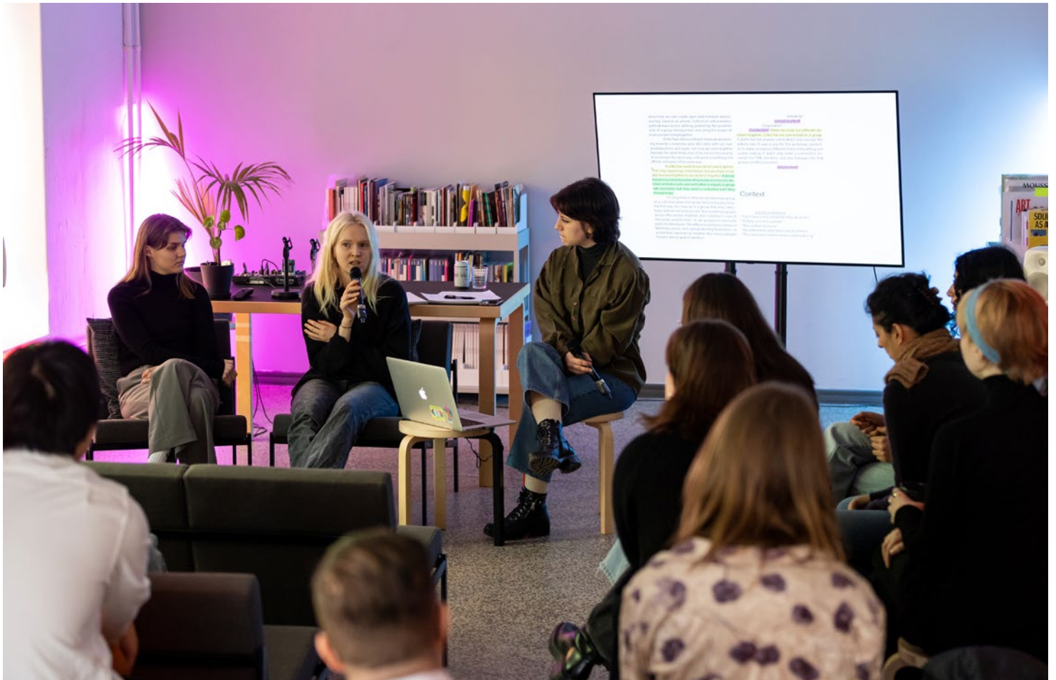
PUBLICS youth group Podcast Launch