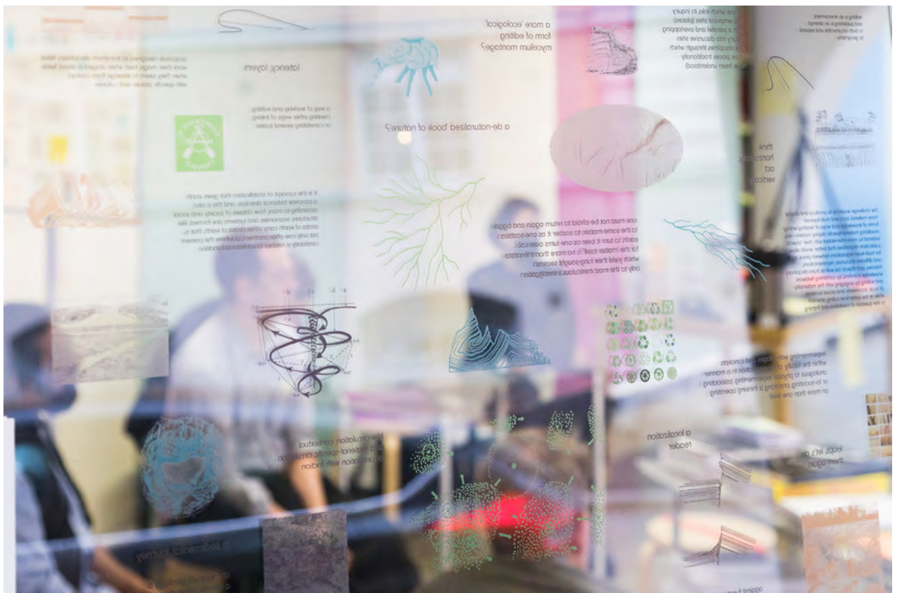
OEI installation detail (2021) and workshop, The Month of Books