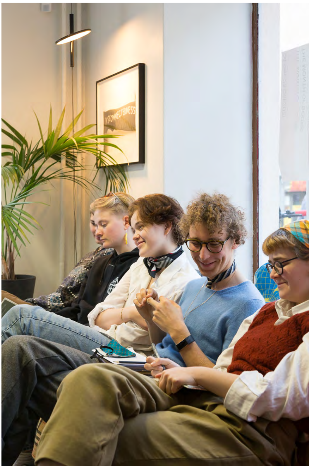
In Character: Conference with Index and Praksis Teen Advisory Boards.