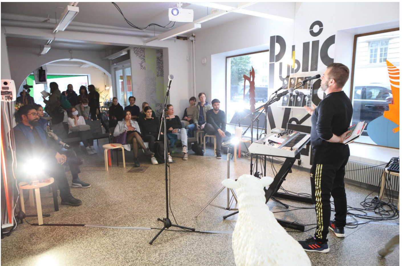
The Itching Triangle event for limited audience in September.