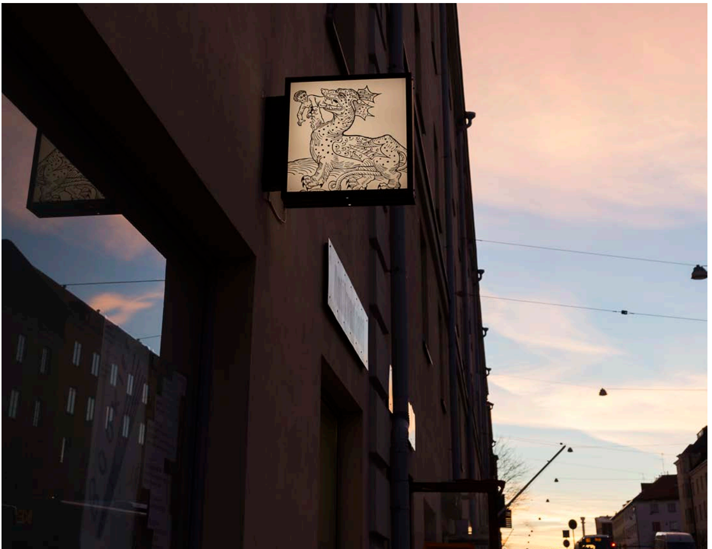
Liam Gillick: Eat the Rich (2018).