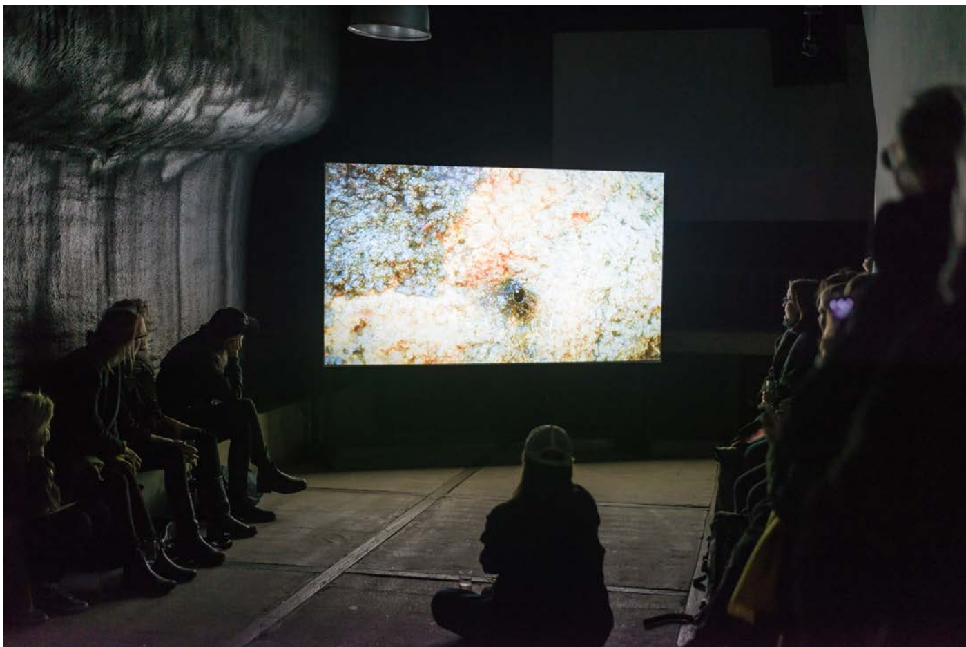
The Karrabing Film Collective: The Mermaids: Mirror Worlds.

In April 2018 PUBLICS presented a new multi-screen work Mermaids, Mirror Worlds by the Karrabing Film Collective—a group of indigenous artists from Australia’s Top End. This was the collective’s first new work following their screening survey at the TATE Modern in London, and their presentation at the Centre Pompidou in Paris. PUBLICS commissioned the work together with Frontier Imaginaries (Amsterdam), the Institute of Modern Art (Brisbane), and Van Abbemuseum (Eindhoven). In addition to the newly commissioned work situated in Merikerho—a ship, which transported cargo from Åland to the Finnish mainland