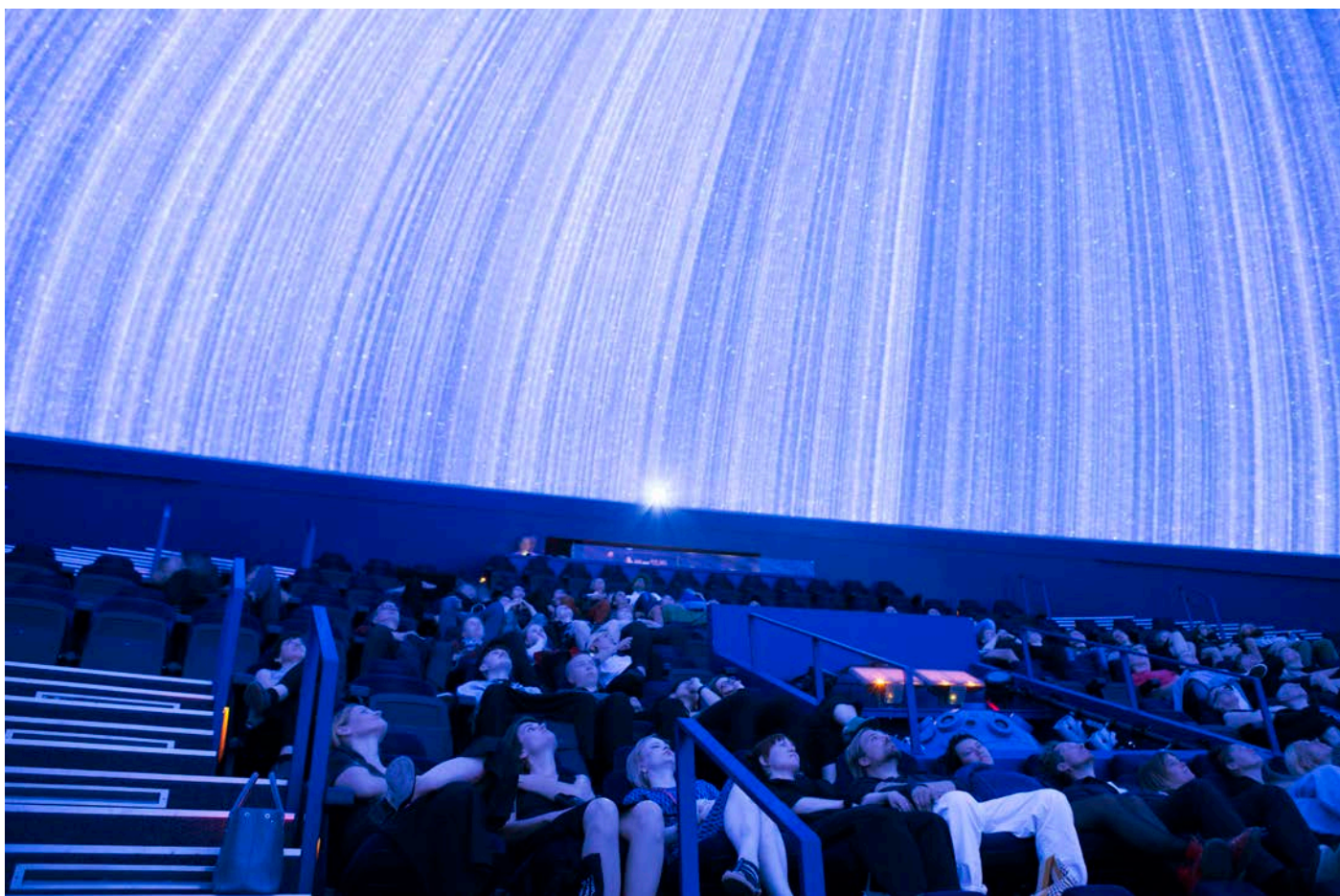
The Optics of Space premiere.