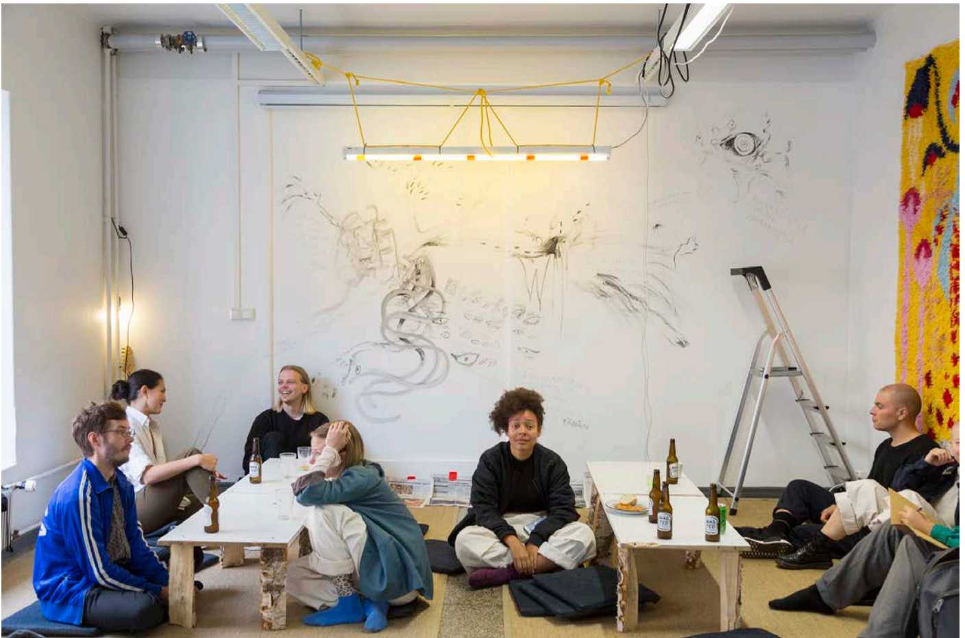
WASTED working at PUBLICS.