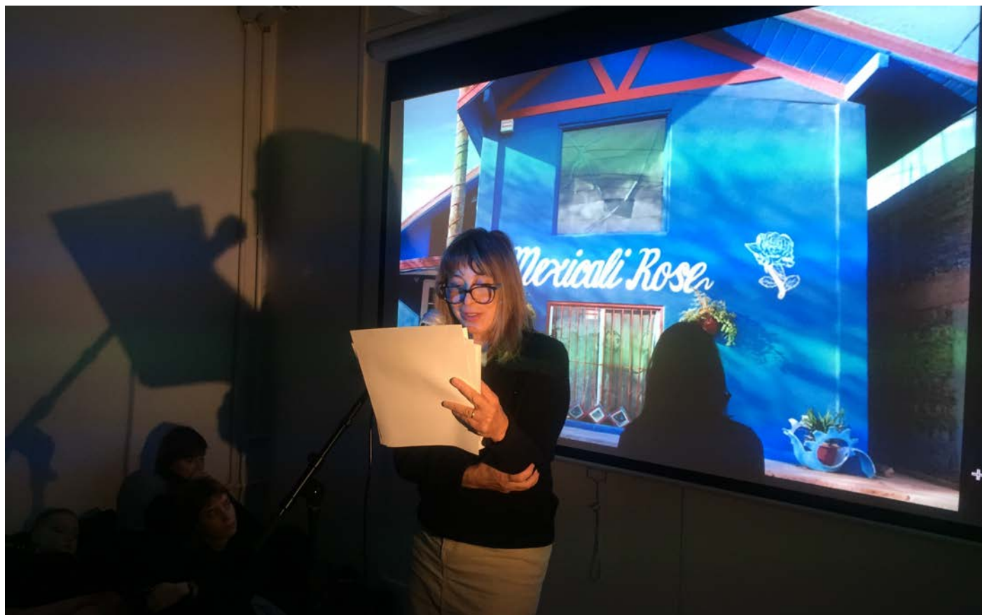
PUBLICS Talk Kelly Lake Store by Chris Kraus.