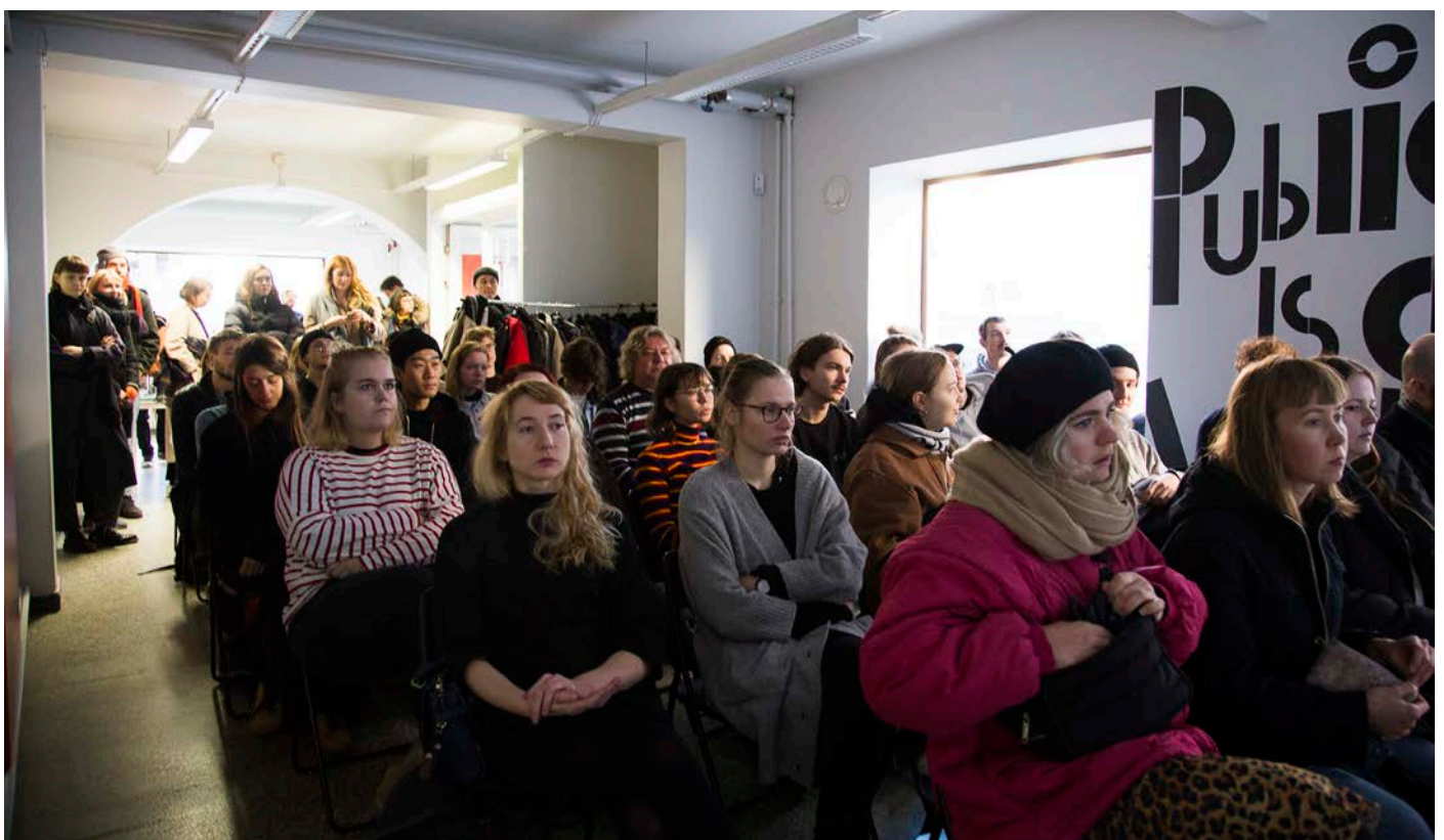
Bookies 2018.